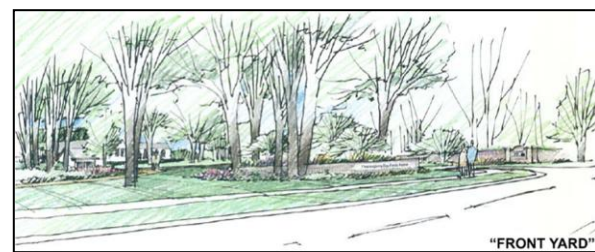
Opening up the entrance sends the message: “We are here and you are welcome.” Phase 1 is already underway through volunteer efforts.

To grow school enrollment to 260, pre-K through high school.