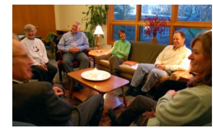
Equipping our congregants to serve exemplifies the New Church message of usefulness that is inherently appealing to all.