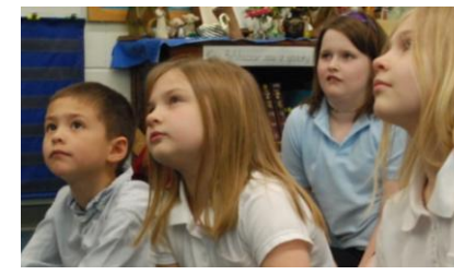
School is one dominant way we serve existing and new families. Engaging families with young children is a key goal moving forward.