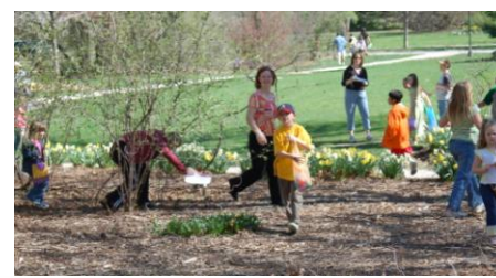
Our annual campus-wide Easter egg hunt, which draws 500 people, is one facet of the process of introducing new people to what we offer.